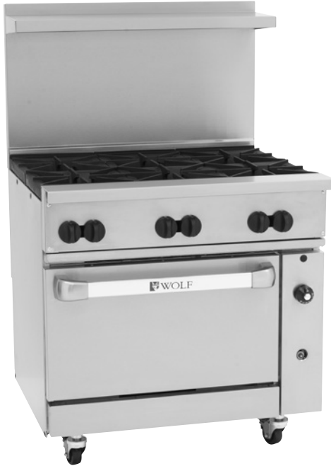
Model C36S-6BN (shown with optional casters)