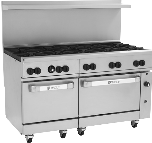
Model C60SS-10BN (shown with optional casters)