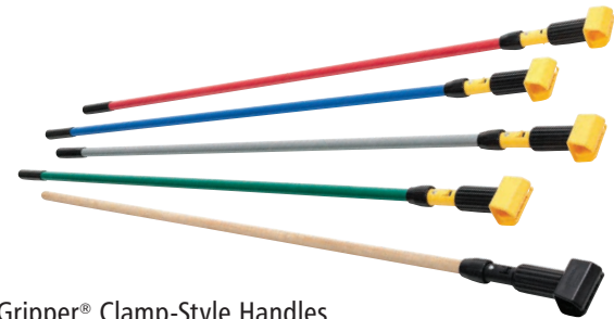
Gripper® Clamp-Style Handles