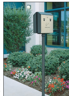
Optional surface mount and in-ground poles accommodate 1 or 2 models. FGSSSM / FGSSIG