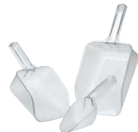
FG288400 / FG288200 / FG288600