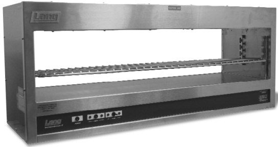
Model 148CMPT shown