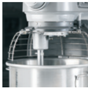
The Bowl Guard is not only easy to remove and clean, but the front portion also rotates so you can add ingredients, and install or remove an agitator.

With its single-point bowl installation, the Legacy literally revolutionized mixing. The Legacy is the only mixer where the bowl swings out, making it simple to add ingredients, take out product, mount and remove the bowl. The bowl lock ensures that the bowl is properly in place for starting. You simply release the bowl lock handle to swing out the bowl for easy access.