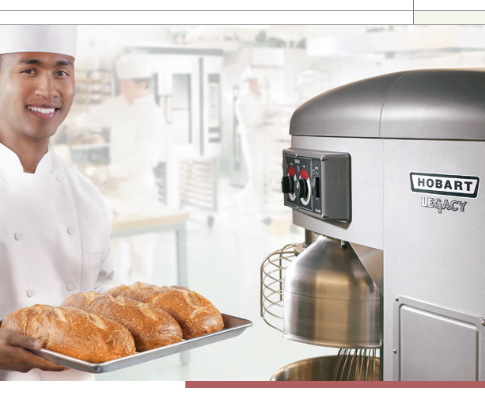
Hobart Legacy Mixers deliver repeat performances daily. So you can, too.