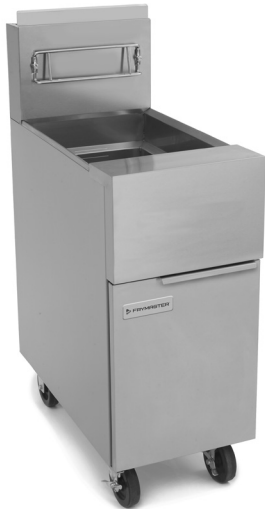
GF40 Shown with casters