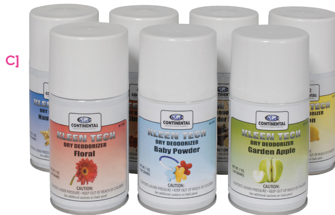
1181 / 1182 / 1183 / 1184 / 1185 / 1186 / 1187

For SDS information, go to: ContinentalCommercialProducts.com\sds.html