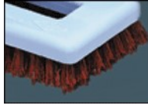
Tynex© A Nylon

Excellent abrasion resistance, shear/break strength, and bristle bend recovery. Very good chemical resistance and sustains temperatures up to 350°F. Best choice for abrasive, rough use.