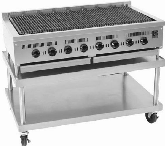
MODEL SCB47C On Optional Stand