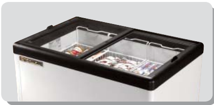
Shown with optional novelty baskets.