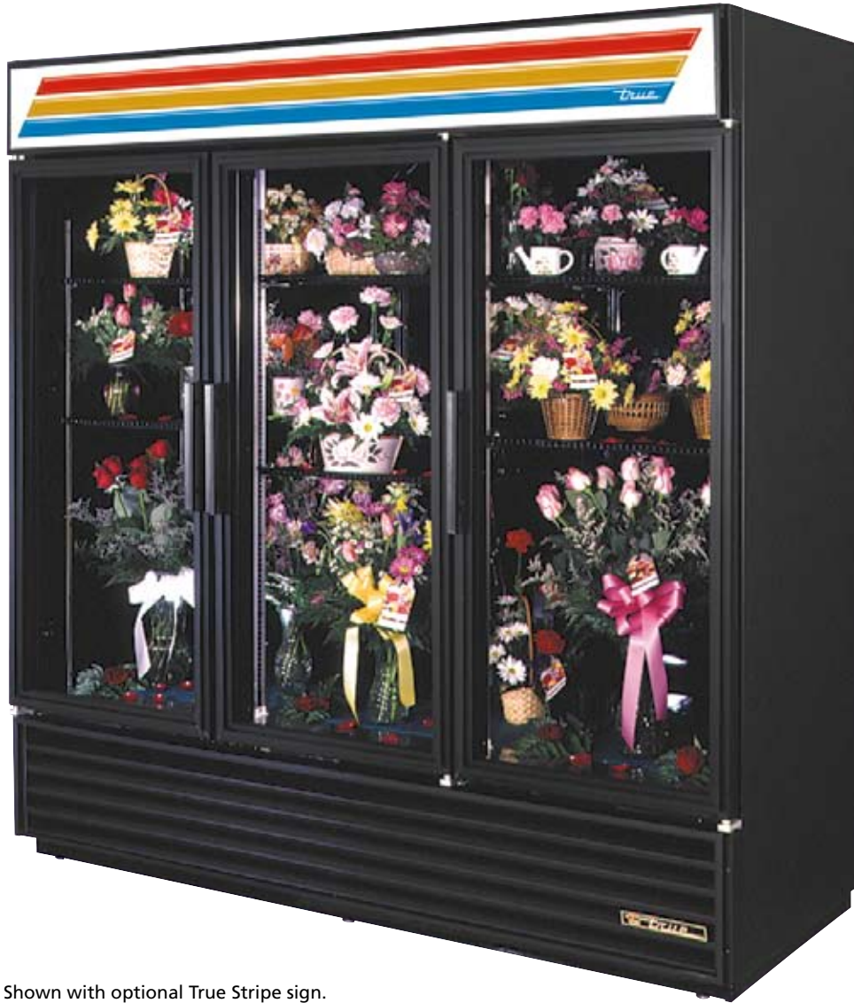
Shown with optional True Stripe sign.