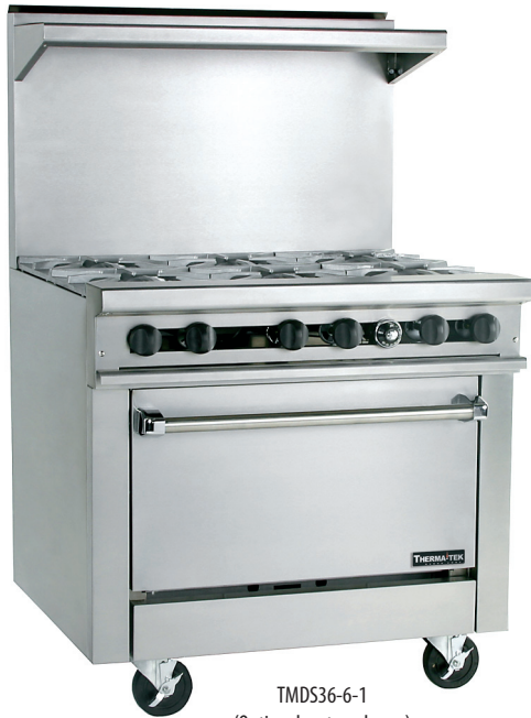
TMDS36-6-1 (Optional casters shown)

Therma-Tek Range Corp. 115 Rotary Drive, Valmont Industrial Park West Hazleton, PA 18202