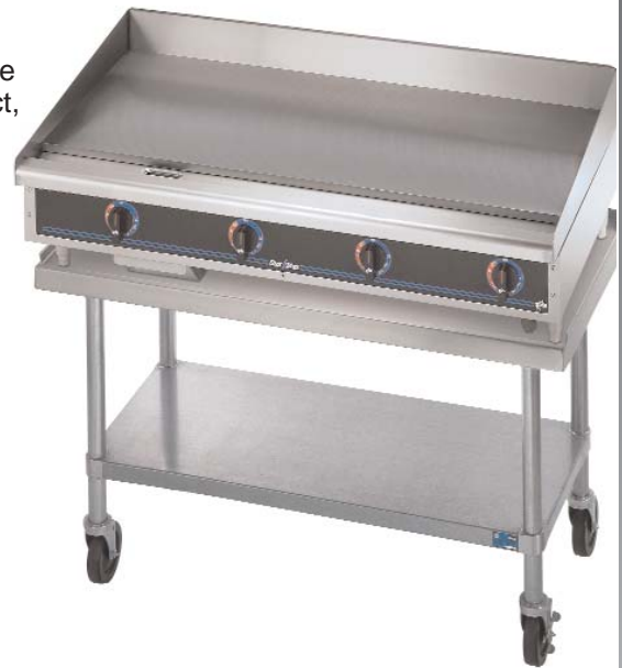
Model 548TGD with Optional Equipment Stand and Casters

Star-Max™ electric griddles are covered by Star's one year parts and labor warranty.