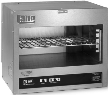
Model MM24-W shown