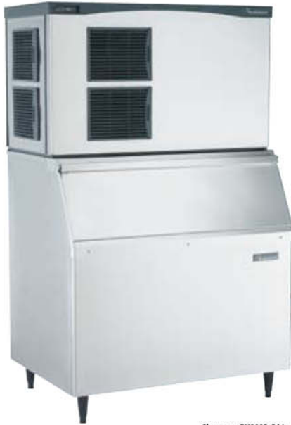
Shown on BH9005-C bin.