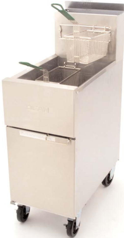
SR42G gas fryer standard with 105,000 BTU (26,481 kcal/hr.) (30.8 kW) burners and 35-43 lbs. (20-25 L) oil capacity. Shown with optional casters.