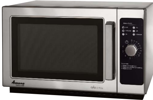
Model RCS10DS shown