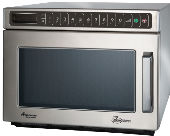
Model HDC212 shown