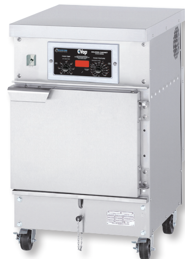
HA4002 CVAP® HOLDING CABINET HALF SIZE, UNDER COUNTER MODEL, FANLESS Electronic Differential Control

CVap equipment complies with domestic and international requirements such as UL, C-UL, UL Sanitation, CE, MEA, and others.