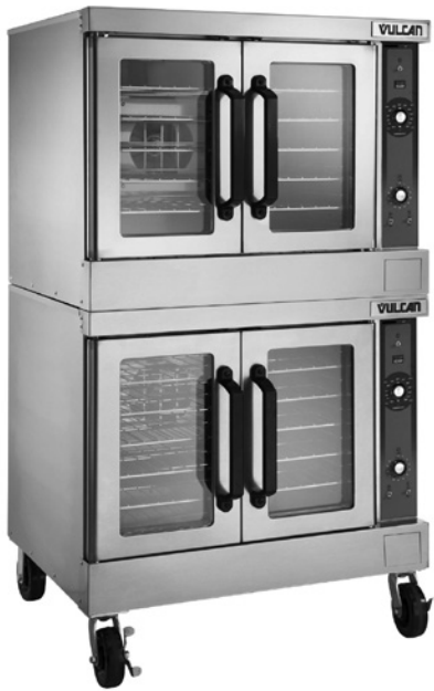
Model VC44ED Shown with optional casters