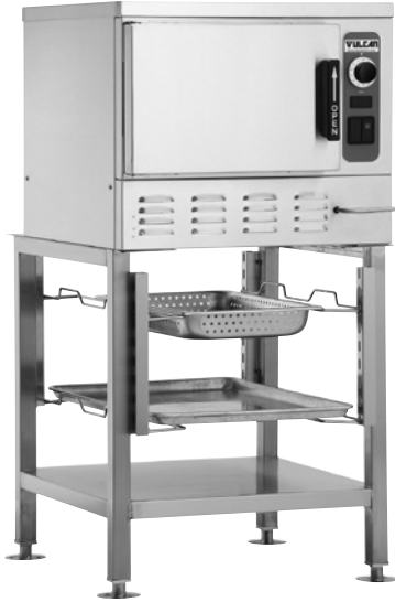
Shown on optional stand with extra set of pan slides and pans