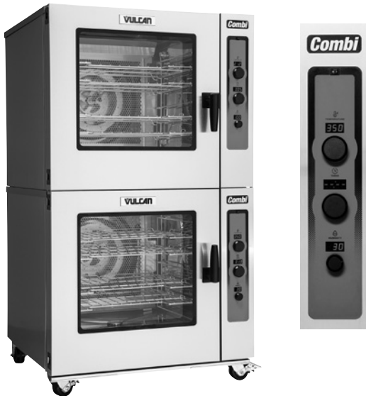
Model ABC7E (shown stacked)