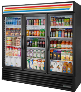
Standard Black Exterior