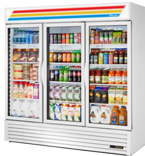
Optional White Exterior