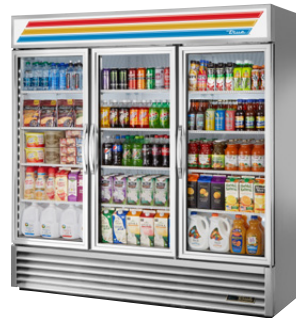
Optional Stainless Exterior