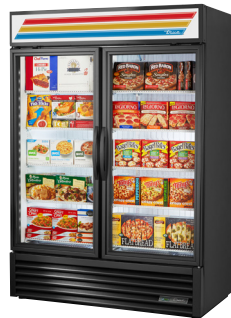
Optional Black Exterior