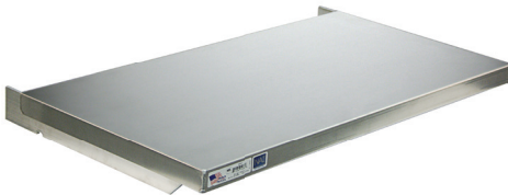
Solid Brute Shelf • 700# Wt. Capacity