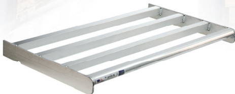
H.D. Bar Shelf • 900# Wt. Capacity

Change Your Shelving As Quickly As You Change Your Mind!