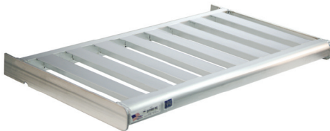
T-Bar Shelf • 900# Wt. Capacity