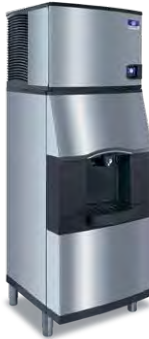
Indigo NXT iT0450 Ice Machine SFA-291 Ice & Water Dispenser