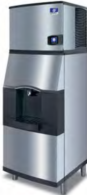
Indigo NXT iT0450 Ice Machine SPA-310 Ice Dispenser

With Indigo and Indigo NXT ice machines you can program the ice machines to be off certain hours of the day so that while the hotel guests are sleeping, the ice machine can be too!