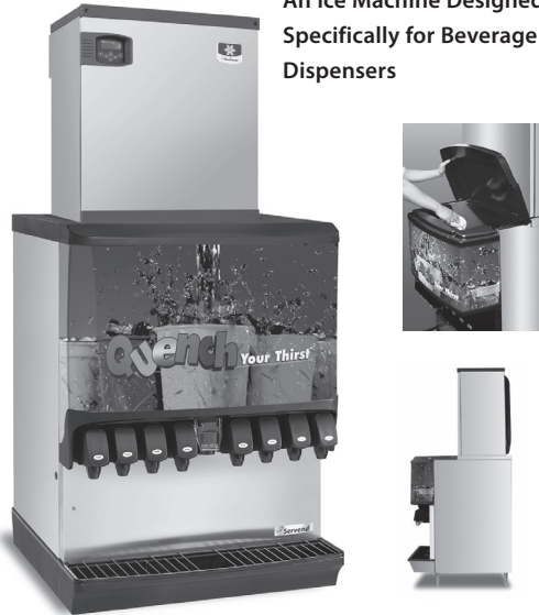
Ice/Beverage Series 696C ice machine - 115V Servend SV-250 beverage dispenser An "NSF Listed" Ice/Beverage Dispenser Combination

An Ice Machine Designed Specifically for Beverage Dispensers