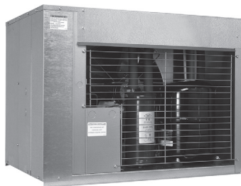
CVD Condensing Unit - 208-230V

QuietQube ice machine with CVD condensing unit is designed as a Manitowoc system and cannot be used with any other ice machine or remote condenser brand.