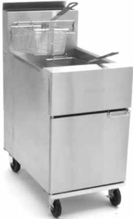
SR162G Shown with optional casters.