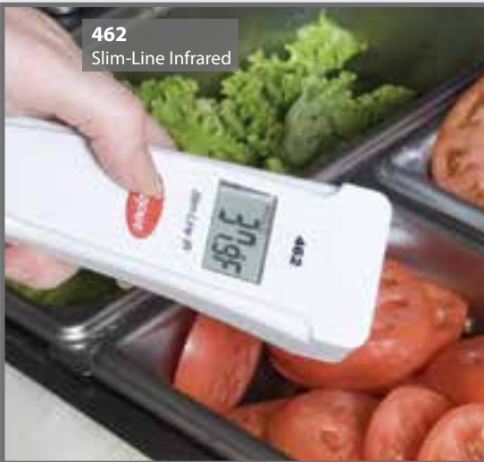
462 Slim-Line Infrared

Non-contact infrared thermometers provide an immediate surface temperature. Simply point the infrared (some available with a visible laser) directly at an area to obtain its temperature. Infrared thermometers are perfect for measuring items in display cases, salad bars, and buffets without touching the food or causing cross-contamination. They are also ideal for checking moving machinery, pipes and overhead equipment in any kitchen or cafeteria.