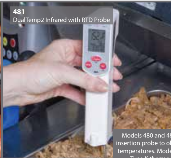
481 DualTemp2 Infrared with RTD Probe