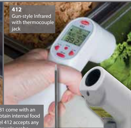
412 Gun-style Infrared with thermocouple jack

Models 480 and 481 come with an insertion probe to obtain internal food temperatures. Model 412 accepts any Type K thermocouple probe