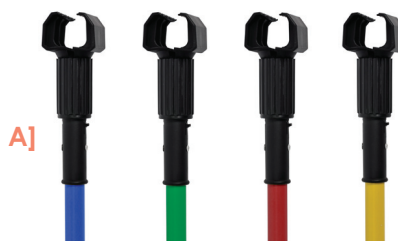
Super Jaws, recommended for wide headbands.