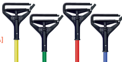
#94 Speed Change, recommended for narrow headbands.